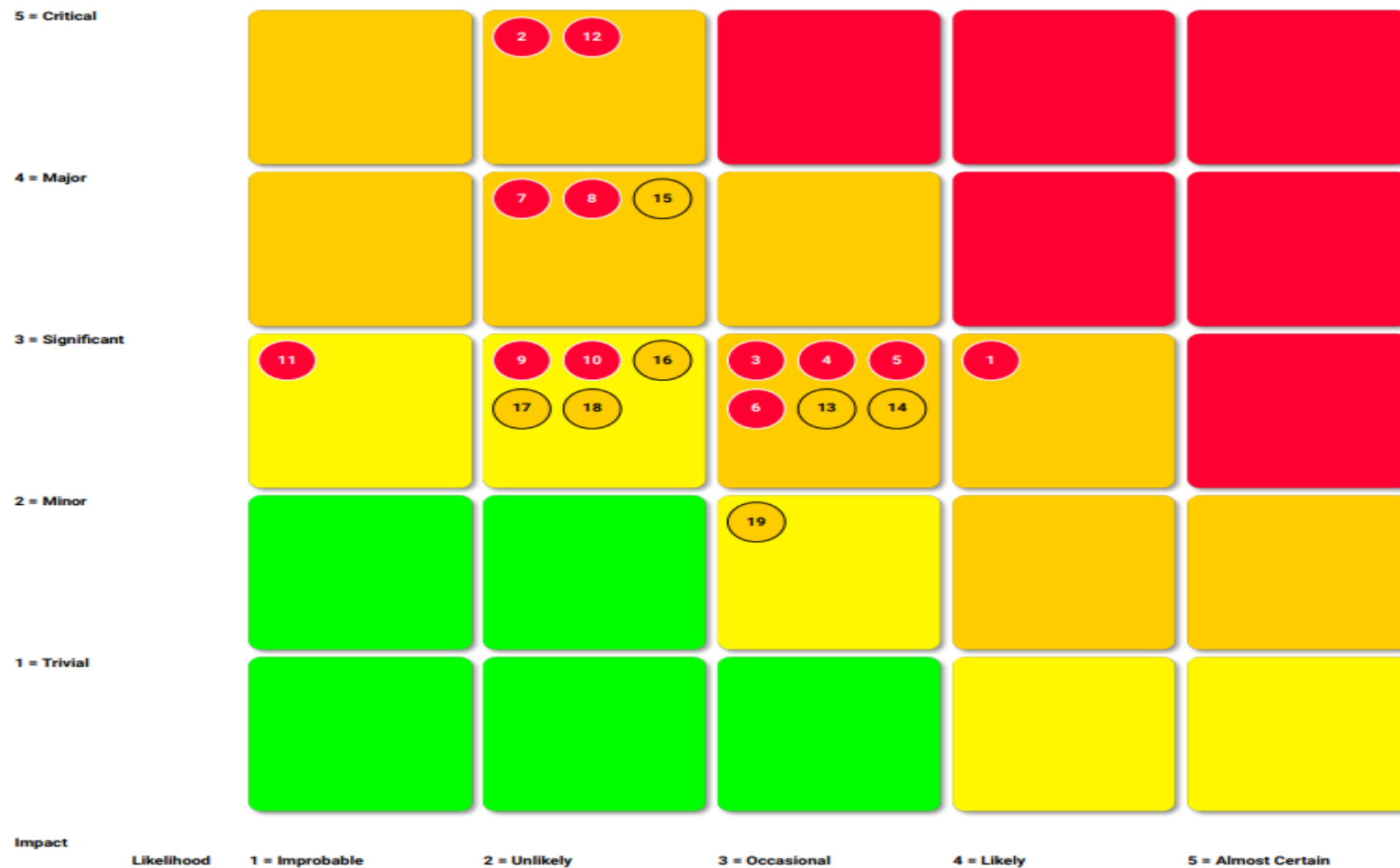
TARGET RISKS – HEAT MAP